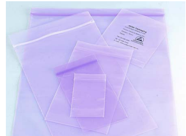
MPK-PAS and MPK-CAS Anti-Static Bag Shown in zip top configuration, and open top with black thermo-transfer markings