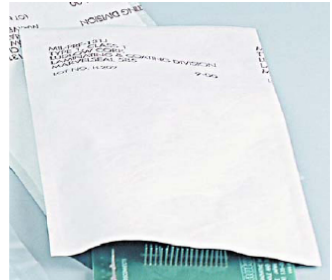
MPK-6000 Tyvek® Foil Polyethylene Moisture Barrier Bag