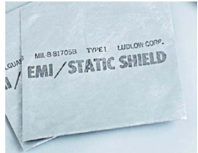
MPK-5000 Static Shield Moisture Barrier Bag