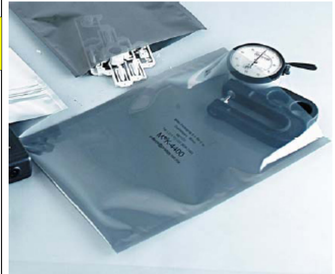
MPK-4400 Semi-transparent Static Shield / Moisture Barrier Bag

or ANSI/ESD STM 11.11 or < 10 11 ohms/square or < 10 11 ohms/square EIA 541 EOS/ESD S11.31 FTMS 101 MTD 4046 FTMS 101 MTD 3005 ASTM E595