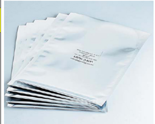
MPK-3400 Foil Moisture Barrier Bag