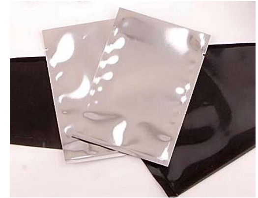
MPK-208BK Light and Moisture Protective Bags Shown in open top configuration