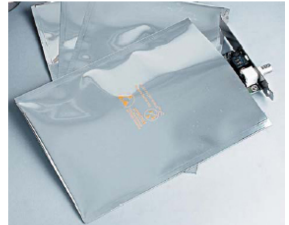
MPK-2000 Static Shield Moisture Barrier Bag