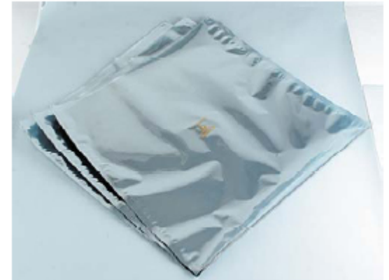
MPK-1500 Metal-out Static Shielding Bag Shown in open top configuration